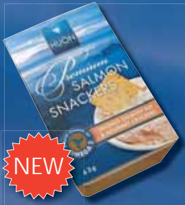
Smoked Salmon 8 x 63g Fresh SK3095H

A convenient and delicious snack consisting of HUON Premium salmon dip and gourmet crackers - perfect for in between meals or on-the-go. The dip contains a generous 44% of traditionally smoked HUON Premium Atlantic Salmon mixed with cream cheese and quality ingredients. With its high Omega 3 content, it makes a healthy alternative to existing snacking products.