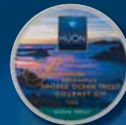
Ocean Trout 54% double-smoked trout 4 x 150g tub Fresh SD3035H

Perfect to serve with crackers, canapés or entertaining platters.