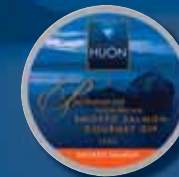
Smoked Salmon 44% double-smoked salmon 4 x 150g tub Fresh TD3035H