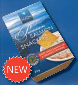
Sweet Chilli Salmon 8 x 63g Fresh SK3495H