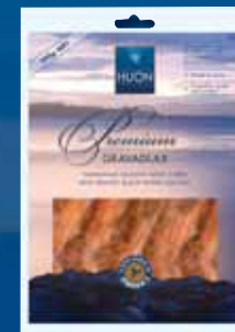
8 x 100g Fresh SS6023H

HUON Atlantic Salmon traditionally hand-cured with brandy, black pepper & dill. Without artificial colours or flavours, fully trimmed and sliced, ready to serve. HUON Gravavlax – perfect for gourmet entertaining.