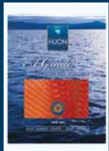
10 x 500g Fresh SS2273H

Features HUON's unique wood-smoked flavour and aroma due to the traditional smoking method. Sliced vertically with a standard trim - ready to serve at a competitive price.