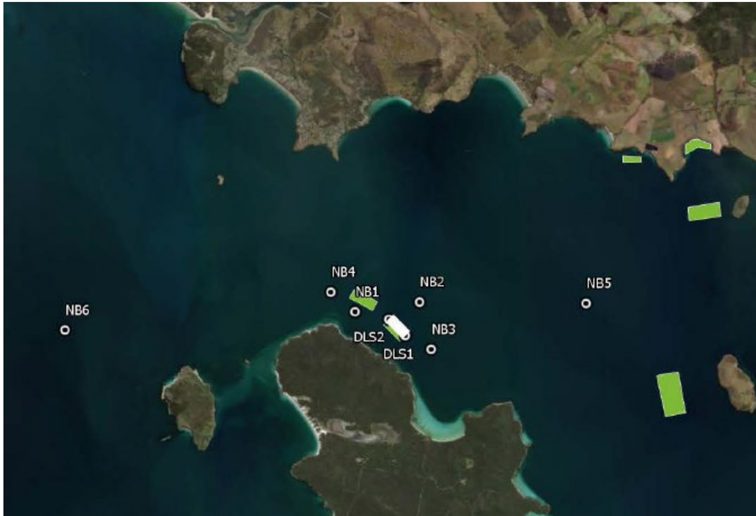
Map of the water quality monitoring stations associated with Environmental Licence 9957/1.

NB1- NB6: monthly monitoring stations. DLS1-DLS2: continuous temperature and Dissolved oxygen loggers.